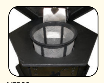
Lift out basket strains out large debris to protect your transfer

*NOTE: Requires 2" diameter vacuum hose and 2" diameter discharge hose