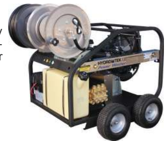
Shown with Wheel kit and hose reel options

8 gallon float tank, Hour meter, Emergency air choke shutoff, Stainless hose reels (150-250ft), Stainless drip pan, Custom color frame, Wheel kit, Trailer and Tank skid