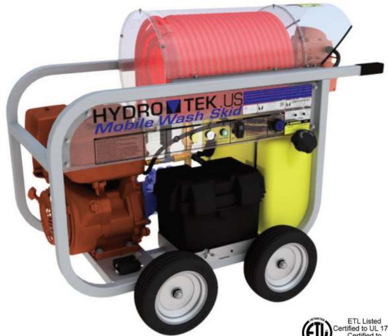
Shown with optional stainless steel frame