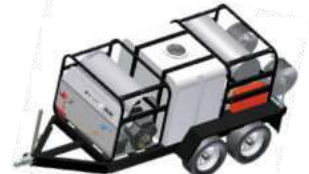
Dual Skid Trailer